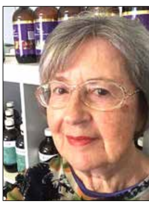
Nature's pharmacy by Trish Clough, herbalist

iving by the bay and beaches of coastal Iluka with its World Heritage listed littoral rainforest I notice the influx of visitors at this time of