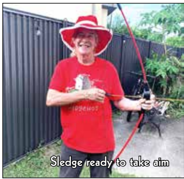
Sledge ready to take aim

However, I see little movement in that direction among our leaders,