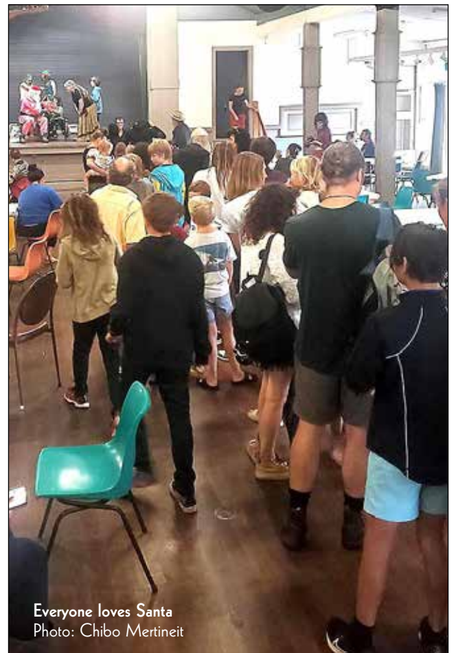
Everyone loves Santa

www.nnic.org.au www.facebook.com/pages/Nimbin-Neighbourhood-and-Information-Centre