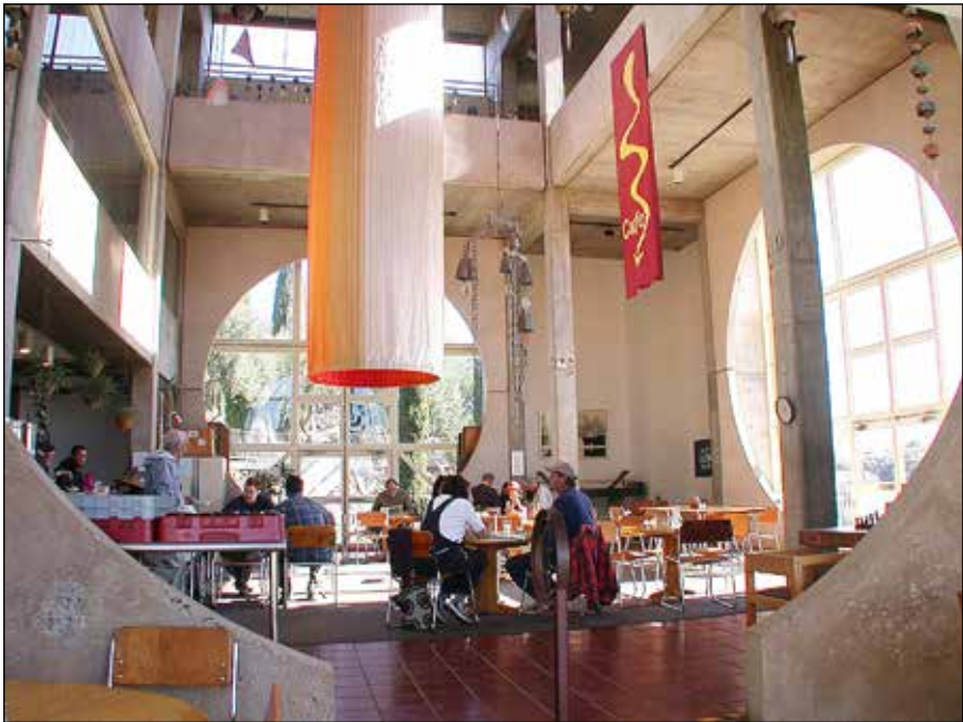
ARCOSANTI Crafts III Cafe. This multi-function facility demonstrates one of the characteristics of Soleri's arcology concept, which integrates living, recreational and working conditions within a single structure. The Cafe is warmed in the winter through warm air collected under the skylight, blown down through a fabric tube into the atrium.

My feeling is that for the Age of Aquarius to be real, it needs some serious discussion now more than ever, for the future generations' sake.