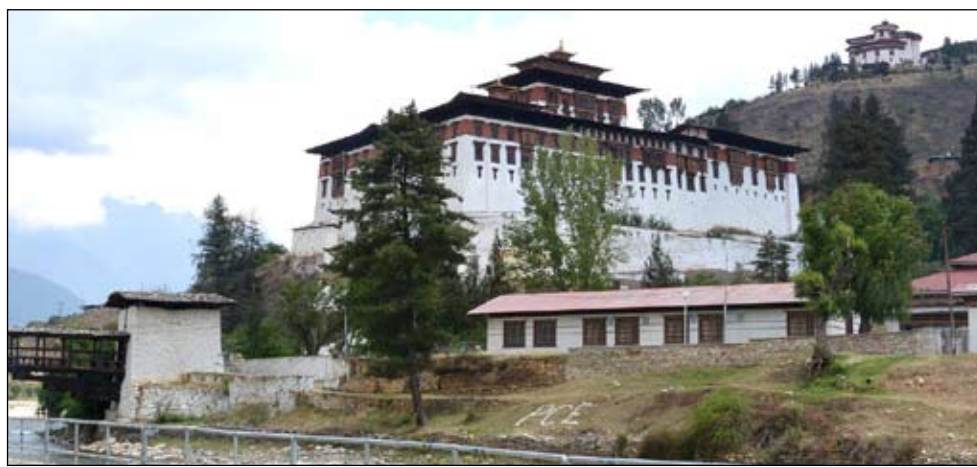
Pawo Dzong, where the lord formerly lived, now used as an administrative centre.