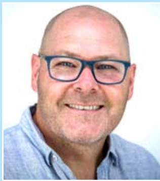
by Steve Krieg Mayor, Lismore City Council