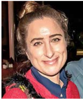
by Diana Gosper, Rainbow Power Co.

I want more power! I want free power! I want reliable power! But what is power? It can't just be the 240 Watt plug on your wall, right? Right.