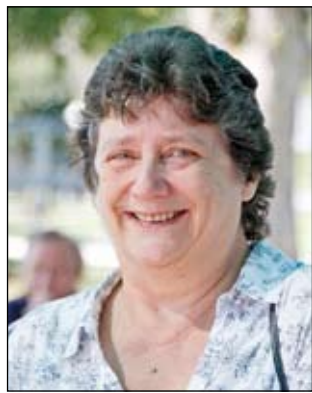
by Cr Darlene Cook Lismore City Council

February will see the first ordinary business meeting of the new council with the usual agenda of business matters that require decisions from the elected members.