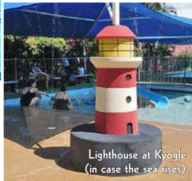
Lighthouse at Kyogle (in case the sea rises)

attractively set in grassy areas. The wading pool is open all year except for July and maintained at 32° by its extensive solar panel bank.