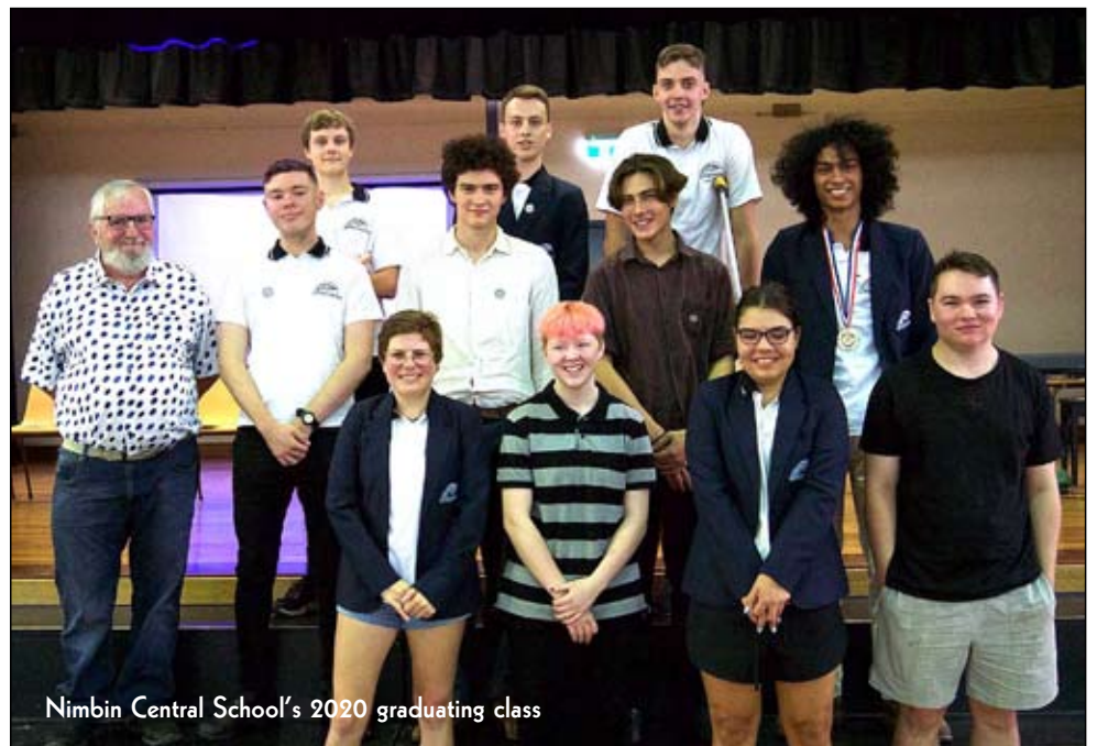
Nimbin Central School's 2020 graduating class