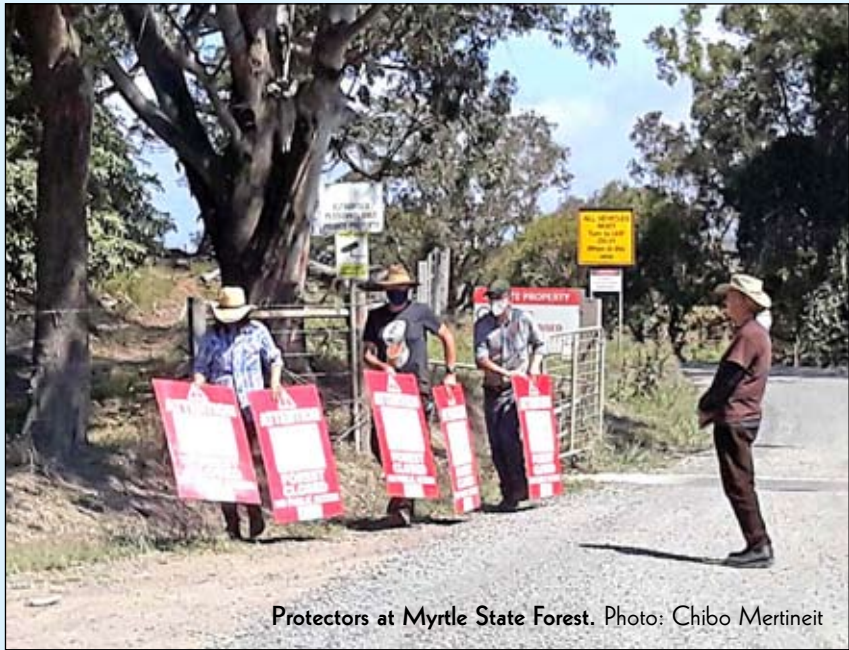
Protectors at Myrtle State Forest.

Koalas surface in Myrtle State Forest Threatened Species Day in September was observed by some forest protectors who spent a cool night at the entrance of Myrtle State Forest to stop any machinery for logging coming into the