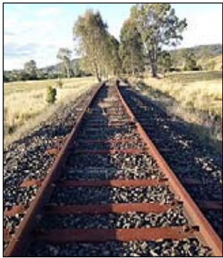
Casino to Lismore line

It seems suspicious that the Federal Government want to be involved in a project that appropriates land that belongs to the NSW Government.