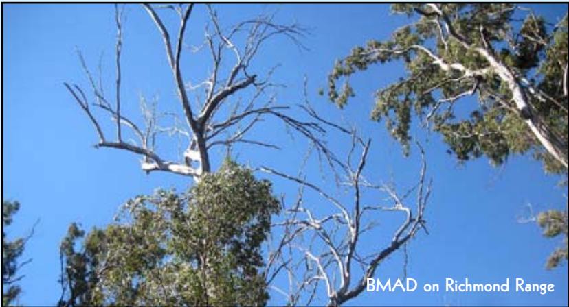
BMAD on Richmond Range

branches protrude everywhere. The canopy is severely compromised. Mapping of these forests across time demonstrates the extent and ever increasing spread of the problem. Lantana everywhere was interfering with regrowth. Patches of crofton weed here and there, and Brazilian nightshade were just a few of the other weeds seen on forays off the road and into the forests on foot via the old logging tracks.