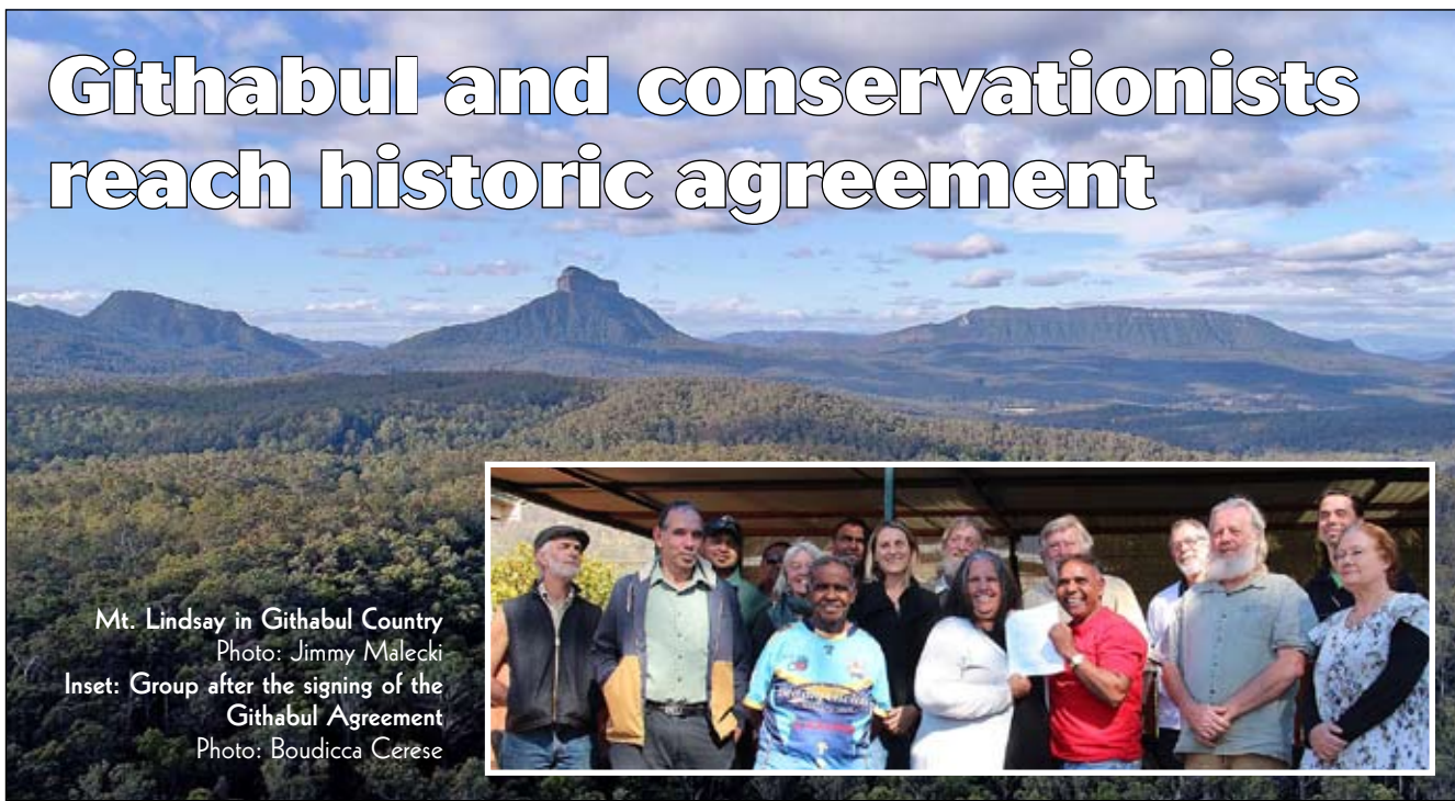
Mt. Lindsay in Githabul Country Inset: Group after the signing of the Githabul Agreement

The Native Title rights and interests of the Githabul people over 1120 sq km in nine National Parks and 13 State Forests were recognized in the Federal Court in November 2007.