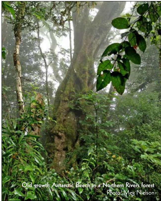
Old growth Antarctic Beech in a Northern Rivers forest

The outcomes continue to get worse as conservation provisions are increasingly wound back in order to get at more timber supplies and the regulation of forestry operations is transferred from the Department of the Environment to the Department of Industry whose primary focus is on the production of timber