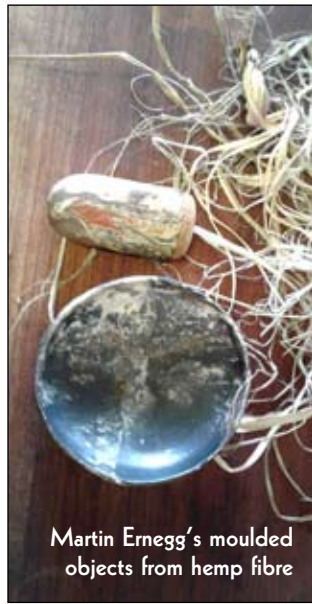
Martin Ernegg's moulded objects from hemp fibre

A hectare of land will produce one ton of seed in poor conditions and as much as three tons under good conditions. You do the maths but I'll give you a hint, it's a