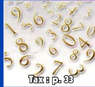
Tax : p. 33