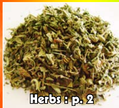
Herbs : p. 2