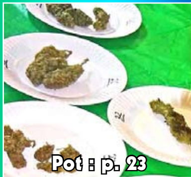
Pot : p. 23