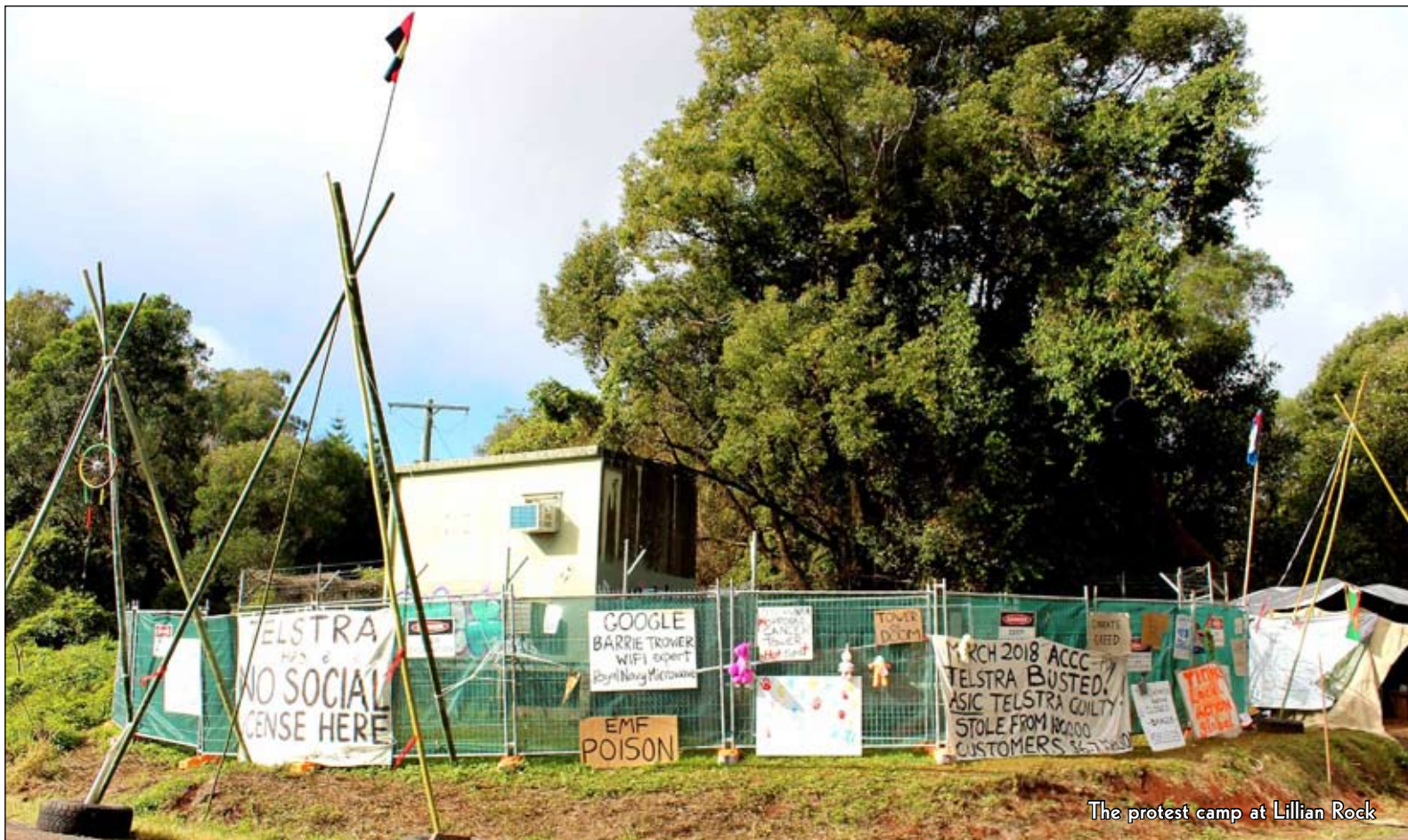
The protest camp at Lillian Rock

Read Aidan Rickett's article on page 13.