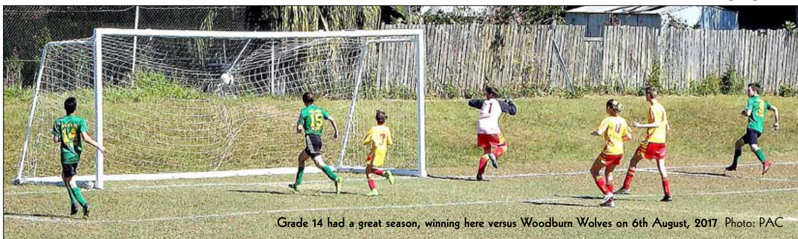
Grade 14 had a great season, winning here versus Woodburn Wolves on 6th August, 2017

The NSW state government is coming to the party with their Active Kids voucher system, which allocates $100 towards the cost of sporting participation for under-18 year olds. Nimbin Headers Sports Club is a registered organisation for the purposes of voucher redemption. Check out their fact sheet at: https://sport.nsw.gov.au/sectordevelopment/activekids or follow the link from our facebook page.