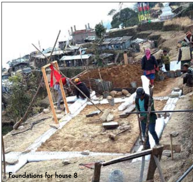
Foundations for house 8