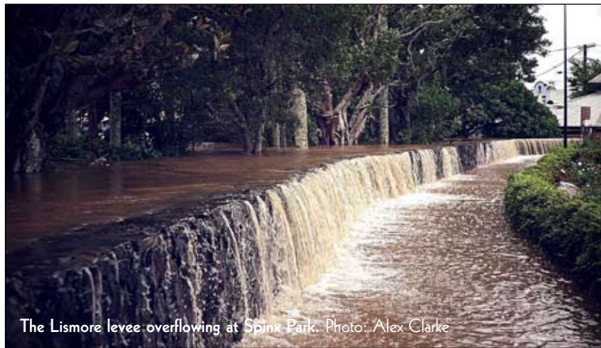
The Lismore levee overflowing at Spinx Park.