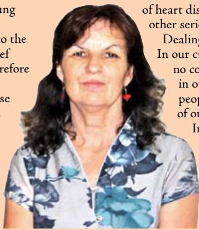
by Brigid Beckett

The emotion connected to the lungs is grief. Excessive grief weakens the lungs and therefore qi. Grief is inevitable. The longer we live the more close acquaintances we will lose, as well as having to let go of other things we love, maybe home, career, youth and vigour and eventually life itself. Grief is normal and inevitable when we lose someone or something we love. But there are cases that an emotional trauma is so severe that it affects the person for many years, or cases where grief is held onto for a prolonged time. This type of situation causes the energy to drain away and seriously affect health and wellbeing. More recently it has been called prolonged grief disorder and is associated with increased risk