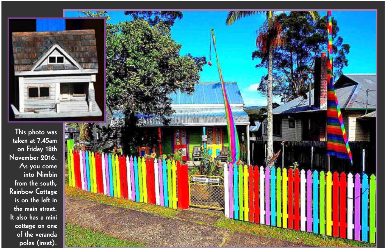
This photo was taken at 7.45am on Friday 18th November 2016. As you come into Nimbin from the south, Rainbow Cottage is on the left in the main street. It also has a mini cottage on one of the veranda poles (inset).