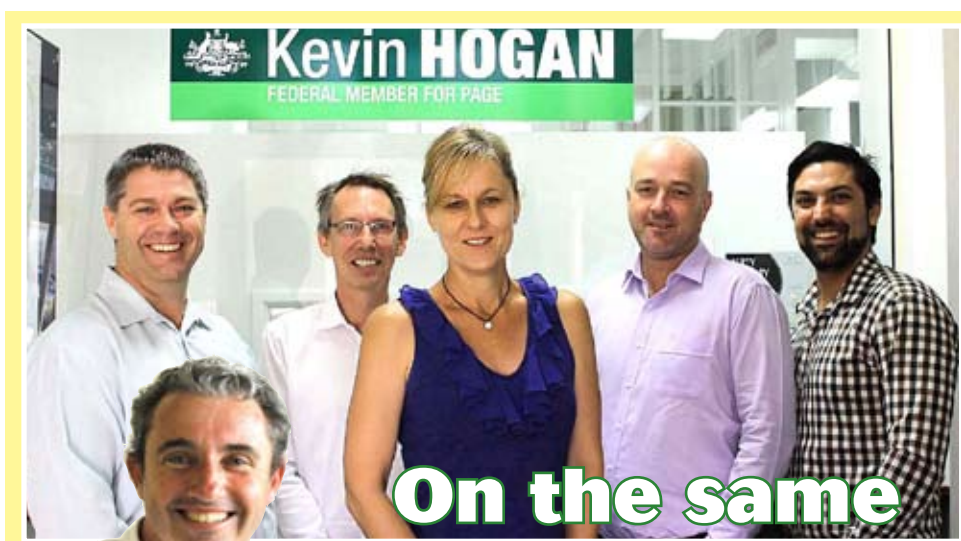
Kevin Hogan MP Member for Page