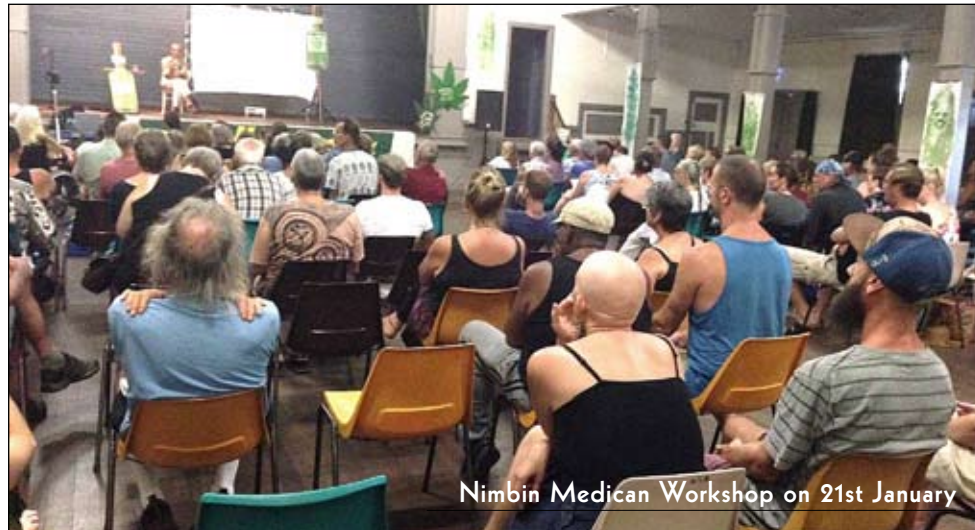
Nimbin Medican Workshop on 21st January

their stories to the Greenlight website, and further campaigns are lined up after full page adverts in the Sunday Fairfax papers recently. Interestingly, the ads were lined up for the Murdoch papers but at the last minute they hiked the price up and forced them to pull out.