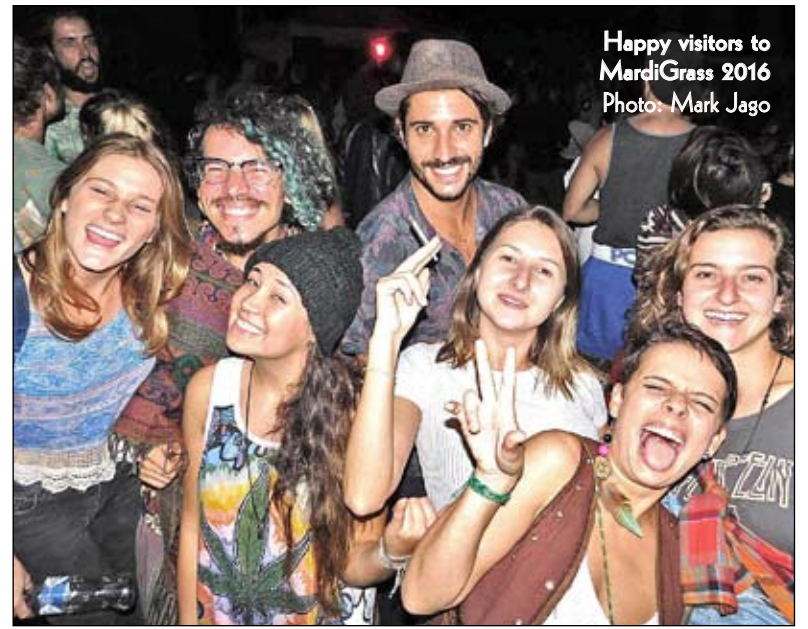
Happy visitors to MardiGrass 2016

Yet the police are going harder than ever at pot supplies while big corporations are gearing up to supply chemists where you will get legal medicine after your doctor gives you a prescription. All by the end of this year! I heard it with