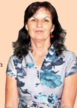
by Brigid Beckett

The good news is that acupuncture is an excellent way to move qi. Rapid results