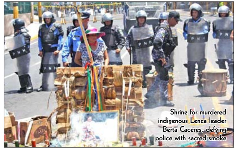
Shrine for murdered indigenous Lenca leader Berta Caceres, defying police with sacred smoke