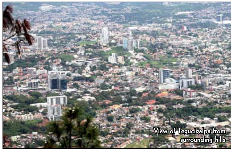
View of Tegucigalpa from surrounding hills

But after a week of intense political discussion with North Americans in the restricted environment of a mini-bus constantly on the road, I was ready for some 'quiet time' with