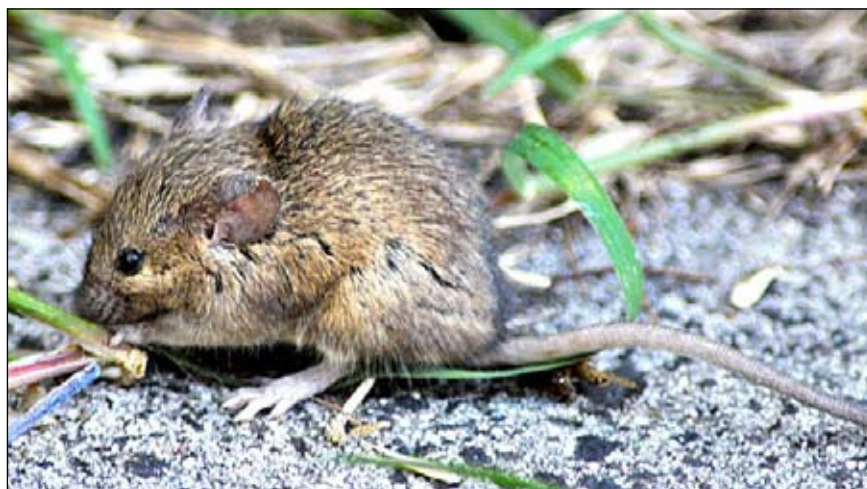
Juvenile Australian bush rat

We managed to eradicate the bush rats, or perhaps closer to the truth was that we repelled them into the valley from whence they had come. My next task for the garden was to eradicate