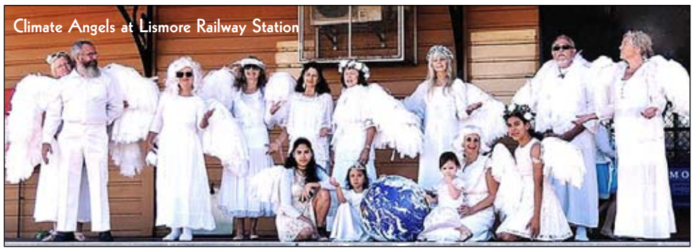
Climate Angels at Lismore Railway Station

Locally, I have recorded it in the Nightcap, Mebbin, Stony Chute and Nimbin Rocks areas.