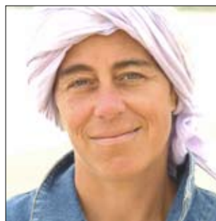
by Betti Wille

Childhood is supposed to provide us with safe attachments and havens to return to after countless adventures. Unfortunately, lots of our caregivers were children of war, abusive families or