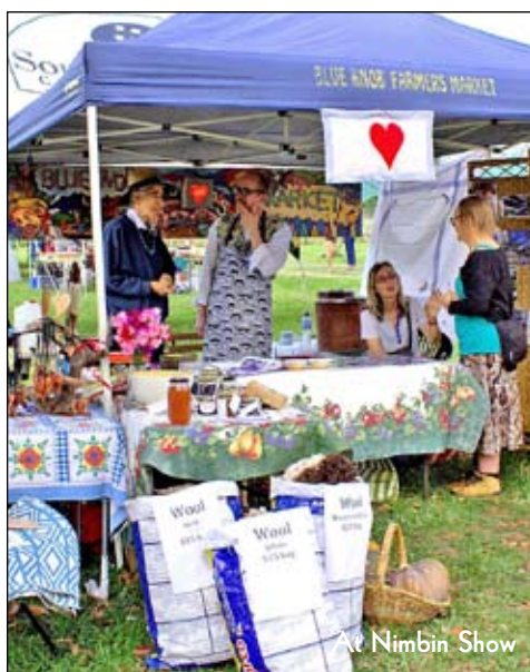
At Nimbin Show

The series will be held on five consecutive Saturday mornings in the Moore Workshop Space at the Blue Knob Hall Gallery, 719 Blue Knob Road (Cnr Lillian Rock Road)