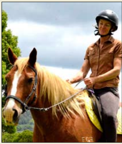
Suzy and Rumpy

When pain is created for the horse via bits, whips, spurs or other painful training aids, otherwise known as negative reinforcement tools, the stress hormone cortisol is released. Cortisol triggers the flight response necessary for the horse to prepare its body to run from predators. It also hinders learning and memory recall. So what this means is that the very tools that are used to actually 'control' the savage beast are in fact the things causing it to be a savage beast in the first place. They stimulate the horse into flight mode and ensure the mind is not calm and capable of