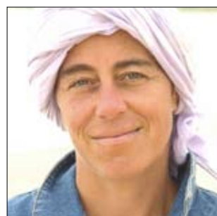
by Betti Wille

The concept of the nuclear family is failing more and more. We're in need of connection within our species but concentrate more and more on things like status, fashion, shopping, gadgets, virtual realities, intellectual concepts or using recreational drugs. All of these are more or less short-term pleasures and cannot replace a soulful connection. What truly matters in the end are helpful actions, meaningful relations and opportunities to express love, gratitude and forgiveness.