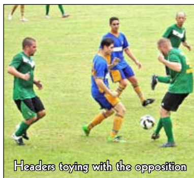
Headers toying with the opposition