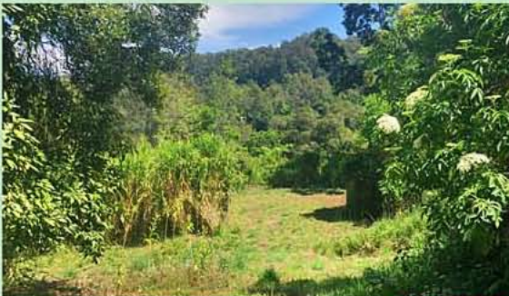
21/265 Martin Rd, Larnook $105,000 PRICE REDUCTION!