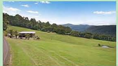
74 Rose Road, Tunttable Creek $695,000