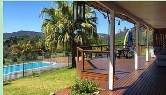
259 Stony Chute Rd, Nimbin $695,000