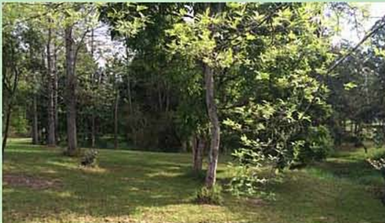
11a Alternate Way, Nimbin $299,000