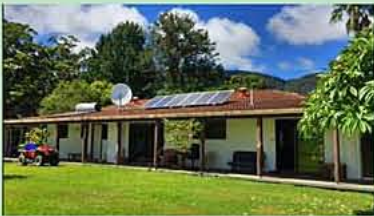
824 Commissioners Ck Rd, Doon Doon PRICE REDUCTION! $690,000