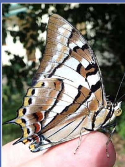
Tailed Emperor butterfly, Polyura pyrrhus Family Nymphalidae, Subfamily Charaxinae I discovered this butterfly beside the road in Thorburn Street during May.