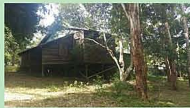
104 Gungas Rd, Nimbin $250,000