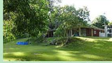
483 Davis Rd, Jiggi $449,000