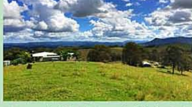
472 Homeleigh Rd, Homeleigh $550,000