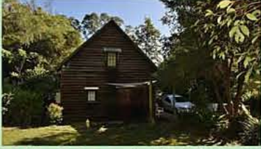
12 Silky Oak Dve, Nimbin $320,000