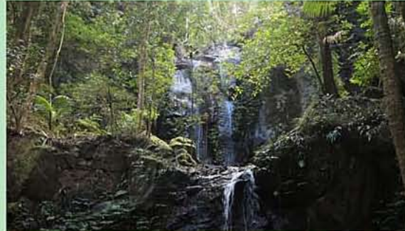
494 Crofton Road, Nimbin $1,000,000