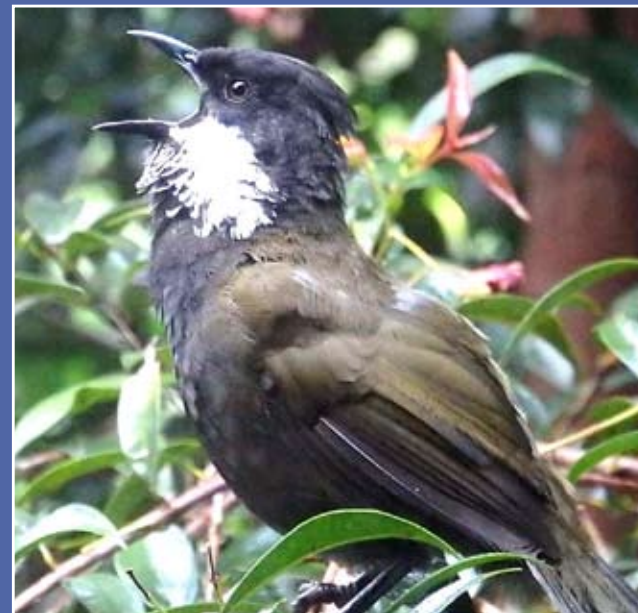
The eastern whipbird ( Psophodes olivaceus ) is an insectivorous passerine bird native to the east coast of Australia, its whip-crack call a familiar sound in forests of eastern Australia. Two subspecies are recognised. Heard much more often than seen, it is a dark olive-green and black in colour with a distinctive white cheek patch and crest. The male and female are similar in plumage.