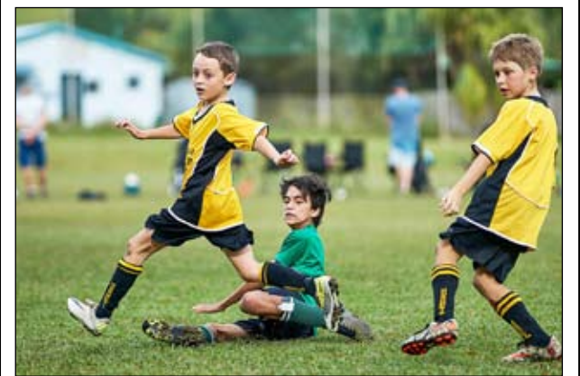
Grade 10 in action