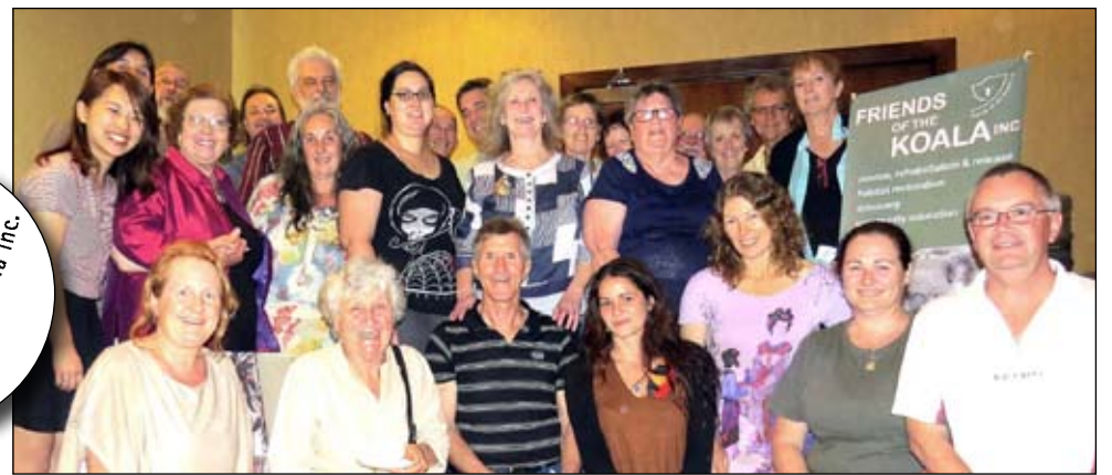
Happy New Year from some of the FOK mob

You can see where this is headed. On the one hand the government is establishing a significant fund (an as yet unspecified share of $100 million) to shore up koala survival and on the other is allowing the single biggest