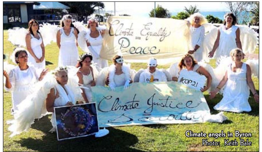
Climate angels in Byron

me naïve, but I have a very deep and painful sense of injury about that – I really expected better; I believed that governments were there to protect and serve the people, not big business.