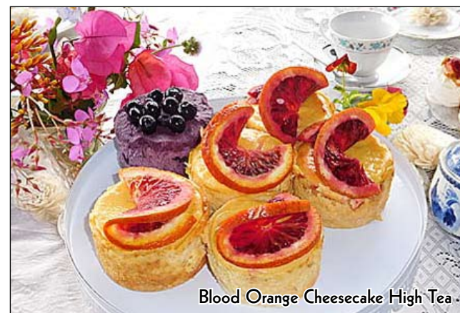
Blood Orange Cheesecake High Tea

Heat coconut oil on medium heat in large pan, then add