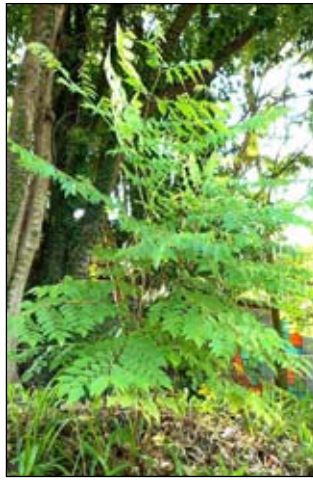
Weed Words with Triny Roe

water treatment or to harvest for mulch, salvinia can be carried to new sites by water fowl thus infesting vulnerable wetlands, recreation zones or causing nuisance for other land holders.