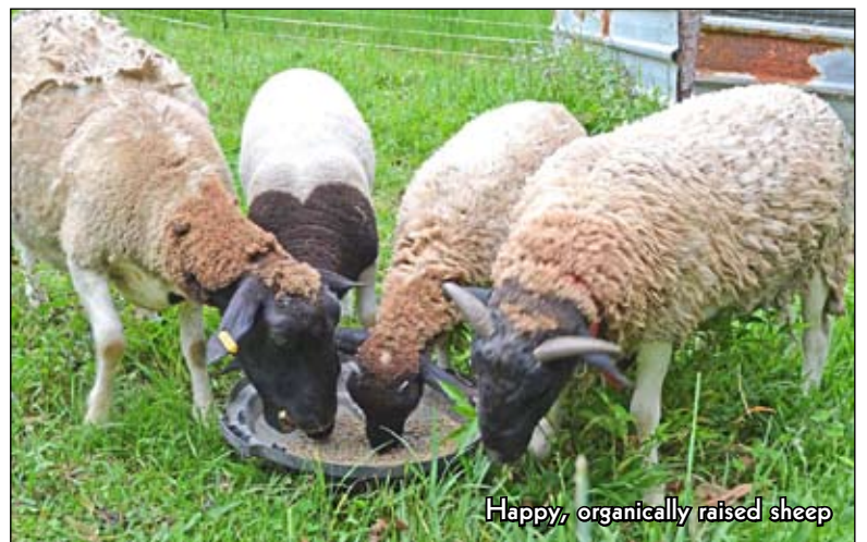
Happy, organically raised sheep

On the other hand, committing to vegetarianism, or veganism as a way out of, or in a direct affront to, Big Meat, is a powerful and liberating argument. Modern animal husbandry is unquestionably environmentally destructive, a big shop-of-horrors blood-sport thinly veiled by razor-wire fences and propped up by fuel and water subsidies. That inefficient, unhappy, soy and hormone-fed meat from the supermarket is unethical and unhealthy in so many ways. Additionally, the argument goes, our modern day marketplace means that all of us can realistically meet our nutritional needs without a