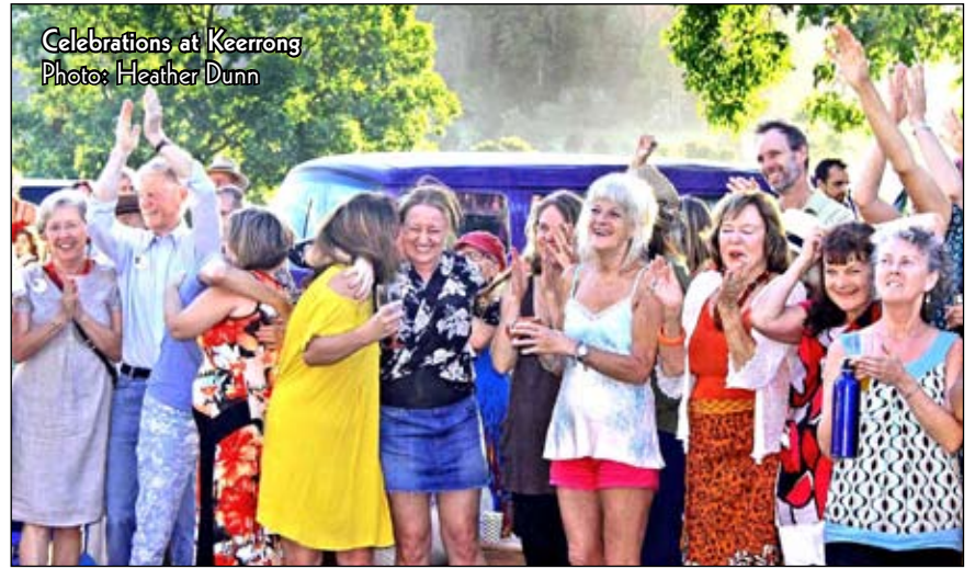
Celebrations at Keerrong

The campaign at Bentley made me realise, with a shock, that politicians have fundamentally betrayed us. Call