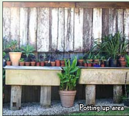
Potting up area