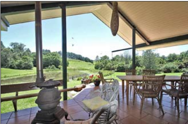
463 TUNTABLE CREEK RD, THE CHANNON $1,800,000