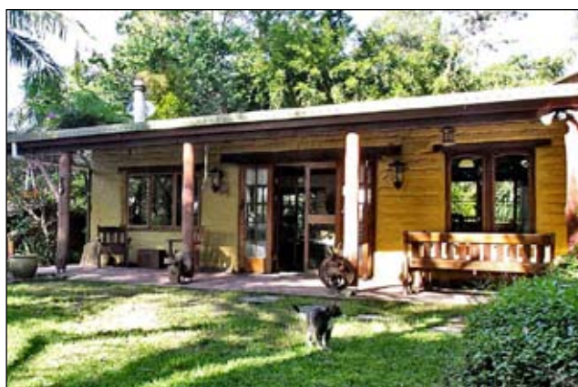
25 FARAWAY ROAD, CAWONGLA $669,000