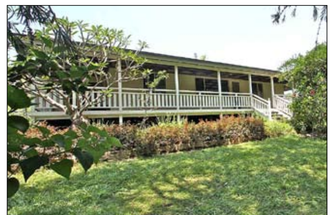
99 ANDERSON ROAD, NIMBIN $795,000