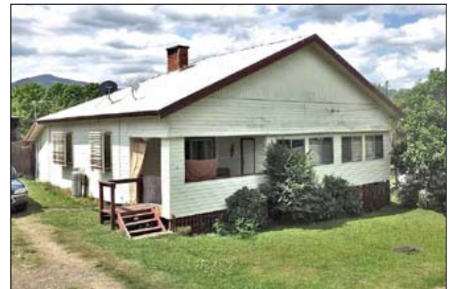
4 THORBURN STREET, NIMBIN $298,000