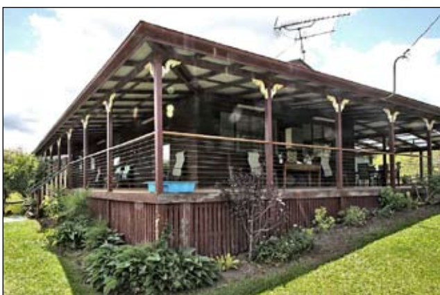
61 CULLEN ROAD, NIMBIN $469,000