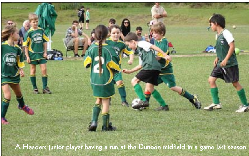
A Headers junior player having a run at the Dunoon midfield in a game last season

We will be holding club sign-on days on Saturday 6th Feb outside the Green Bank in Nimbin (9am-1pm) and at the Headers grounds in Cecil St on Saturday 13th Feb (also 9am-1pm). A much-needed workday at the Headers will coincide with the 13th Feb sign-on, running from 9am-3pm. We encourage everyone to come on down and give us a hand to begin the long process of getting us ready for the pre-season which begins with Anzac Cup games and friendlies in early March for the seniors.