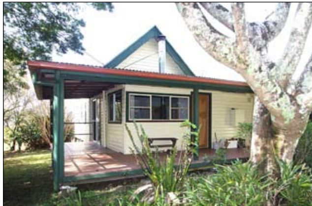
135 OAKY CREEK ROAD, GEORGICA $620,000