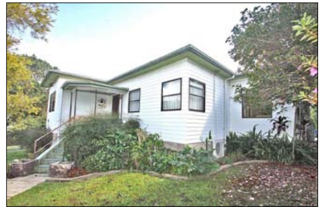
46 THORBURN STREET, NIMBIN $355,000

"Nimbin truly is a unique community with the way it operates and people look out for one another. There's no place like this in Australia and I was lucky enough to be born into it."