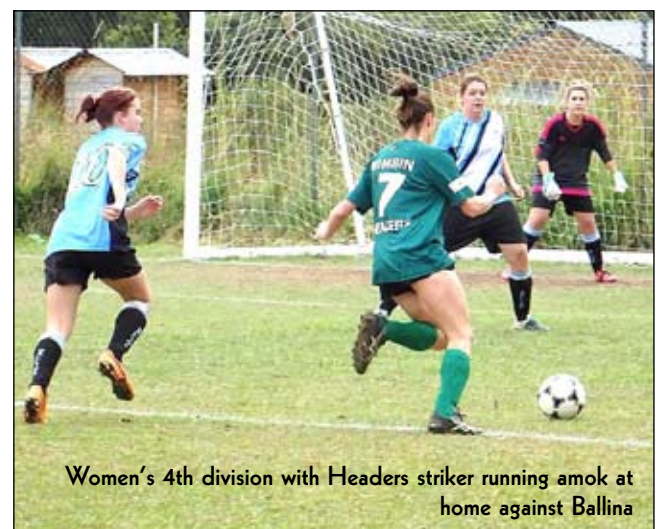
Women's 4th division with Headers striker running amok at home against Ballina

A Headers player is one-on-one with the Villa keeper, but fires the ball straight at him. Then Alstonville is