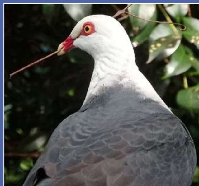
A white-headed pigeon ( Columba leucomela ) with the material to build a nest. It is found east of the Great Dividing Range from far north Queensland to southern New South Wales.