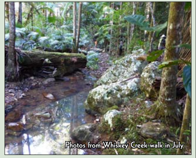
Photos from Whiskey Creek walk in July

Meet: 9am at back of Uki primary school.