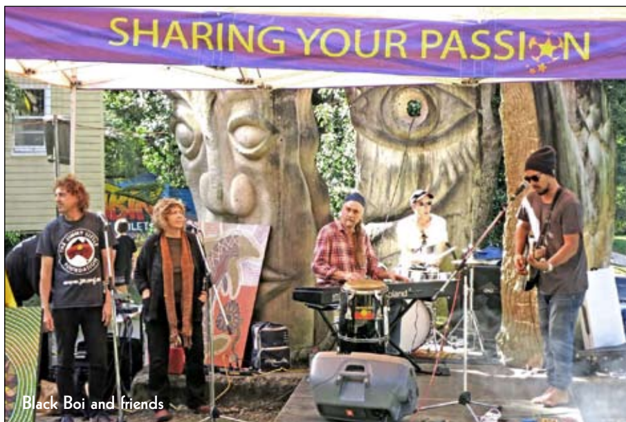
Black Boi and friends

A couple of hundred people enjoyed an incredible feast, with roo stew, salad, BBQ and pumpkin soup put on by a dream team from the Cultural Centre, the NNIC Soup Kitchen and Nimbin Aged Care and Respite Services.