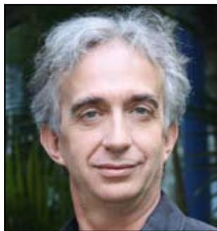
Byron Views Cr Basil Cameron Byron Shire Council

Today the regional landscape comes before the local