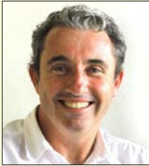
Kevin Hogan MP Member for Page

Thanks to the work of the Jobs Strategy group we already have a number of companies who are interested in moving here and bringing jobs to our community.