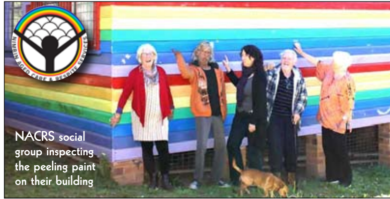
NACRS social group inspecting the peeling paint on their building

Please support the Save the Rainbow Colours fund raising effort. Look out for the Rainbow Raffle in the coming weeks and you can make a direct donation at Summerland Credit Union to