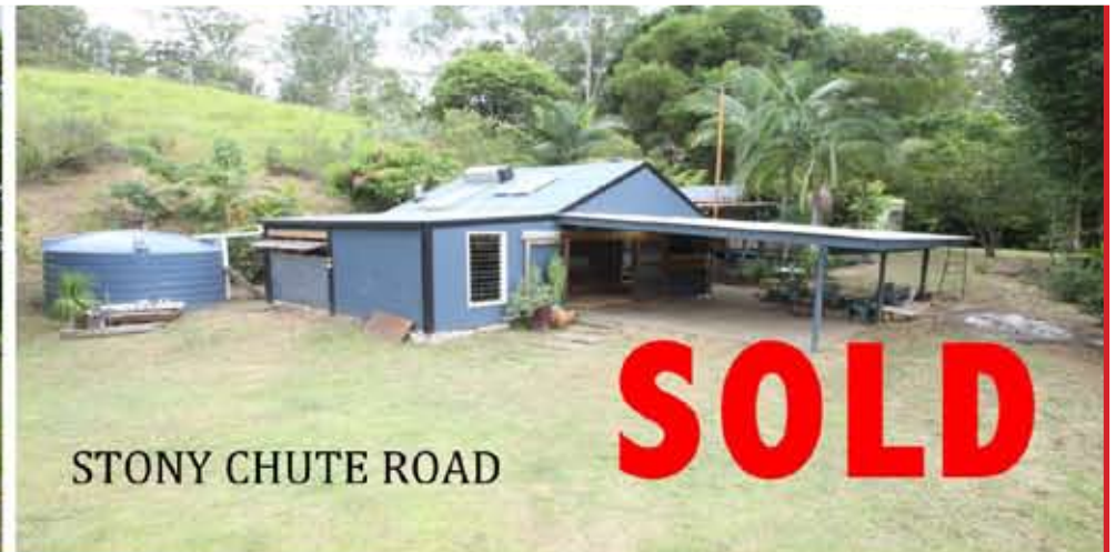
STONY CHUTE ROAD