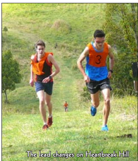
The lead changes on Heartbreak Hill