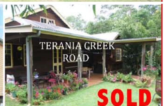
TERANIA CREEK ROAD