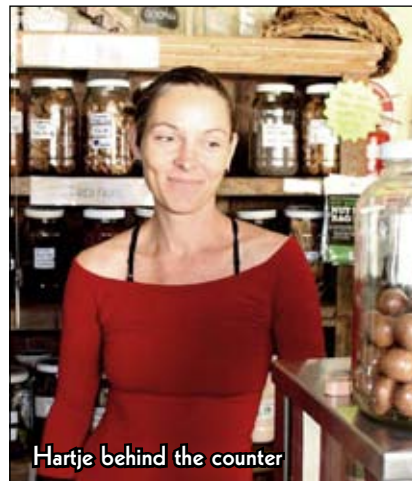
Hartje behind the counter

On-going community support is vital for the continuing success of our entirely volunteer-run, community owned food co-op - as customers, as volunteers, as members. Membership renewal is due in October - please renew your