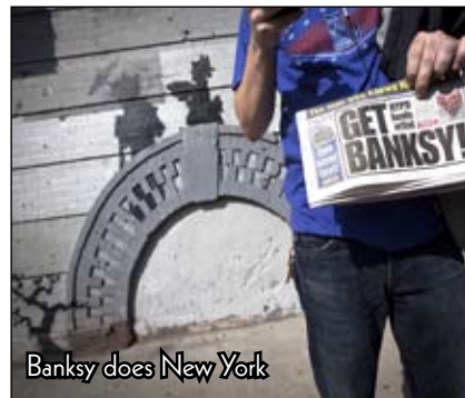
Banksy does New York