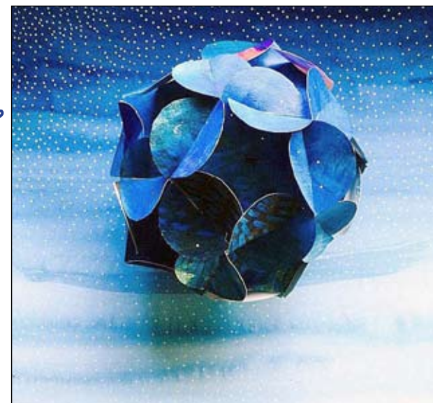
Katie Alleva, 'Little planet 2015'

The works in this exhibition reflect each of the