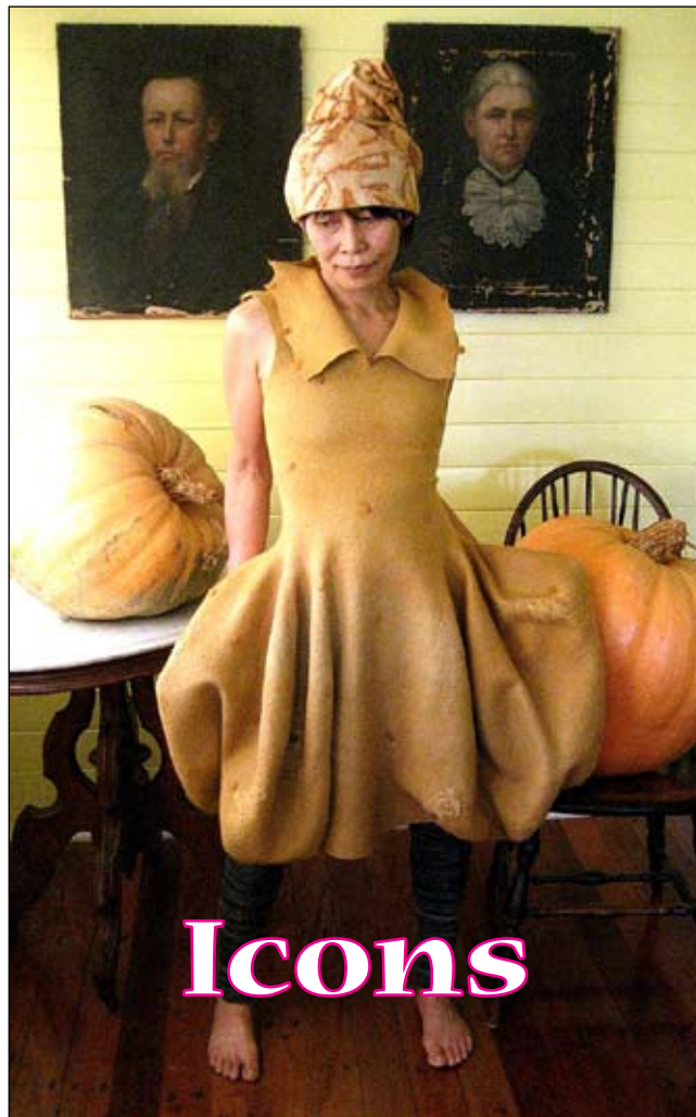
Pumpkin Dress by Polly Stirling

And don't forget, that favourite piece that you regret not grabbing when you could, might be in the gallery now. If you don't see it, don't be afraid to ask. We might be able to track it down for you – it's happened before!