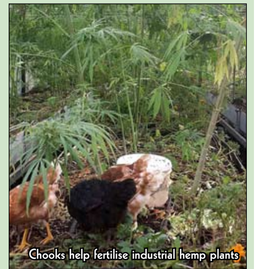
Chooks help fertilise industrial hemp plants

In Nimbin, growing industrial hemp is really a waste of time and resources. Way