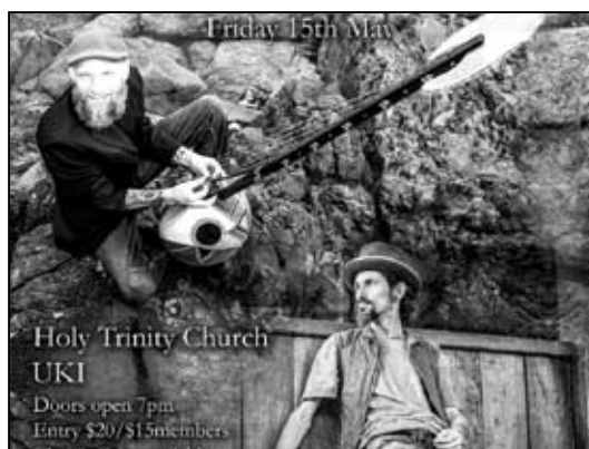
Holy Trinity Church UKI Doors open 7pm Entry $20/$15members

Visit: www.murraykyle.com for more info.