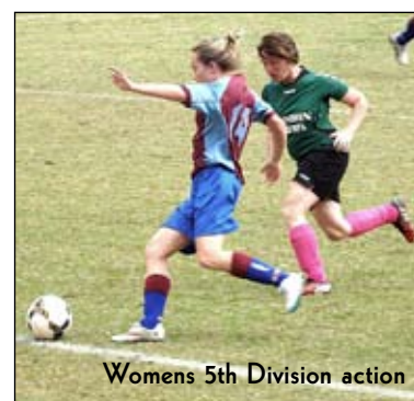
Womens 5th Division action

In the second half, Lennox put another three goals past the Headers who were still fighting hard and