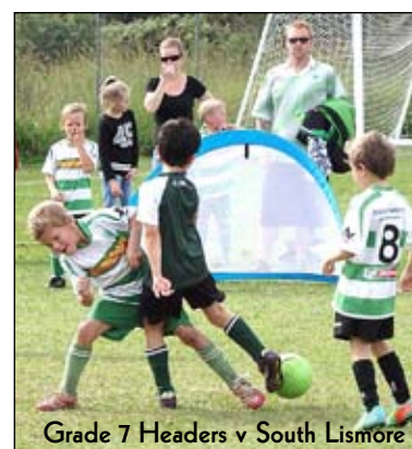
Grade 7 Headers v South Lismore

Come along and join us and be a proud part of the Headers community, the best, most fun and inclusive little club on the North Coast.