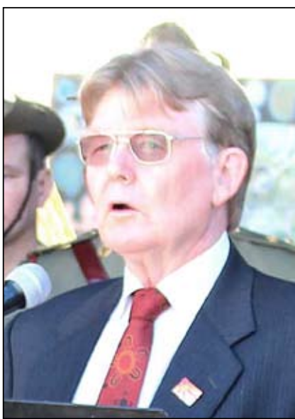
by Cr Simon Clough, Lismore City Council

One of the major concerns is the Investor-State Dispute Settlement (ISDS) provisions, the right of foreign investors to sue governments for damages over domestic law or policy if they can allege it harms their investment. For instance, Philip Morris