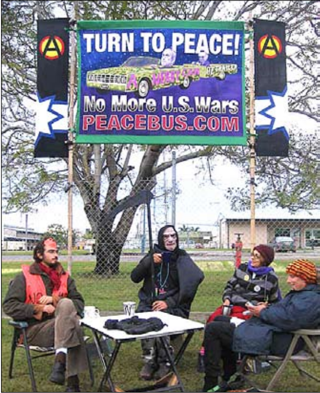
by Graeme Dunstan Peacebus.com