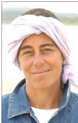
by Betti Wille

Due to the goal of Vipassana meditation, which is not just to calm the mind, but to purify it from all negativities, increased happiness occurs fairly soon. It also nurtures compassion towards oneself and all other beings. Vipassana, a word from ancient India, means 'to