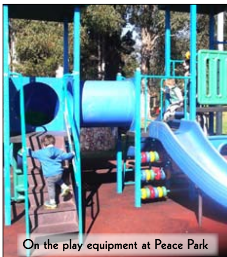
On the play equipment at Peace Park

If you would like to get to know us and the group, please call to book in for Wednesday mornings orientation between 10.30-11.30am.