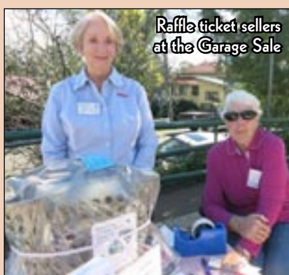
Raffle ticket sellers at the Garage Sale

A huge thankyou to the Nimbin community for their support of the Hospital Garage Sale and raffle in May. We raised over $1,000 for the Hospital Auxilliary to provide equipment for our Aged Care unit.