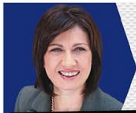
Small Green Ballot Paper