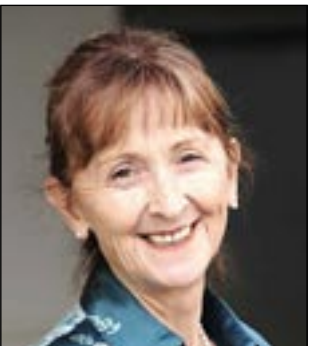
Janelle Saffin Labor Party