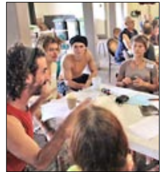
Groups at the Community Design-in for 7 Sibley Street

All of the households who signed up for our solar scheme, plus lots more of you, will be currently getting the Solar Bonus Scheme. The NSW Department of Trade and Investment recently sent us a letter advising that if a customer changes energy retailers they will still be guaranteed the Solar Bonus Scheme feed in tariff at the current rate of .60c/kWh, so don't let any retailer tell you any differently.