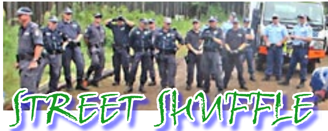
Journal of the North Coast's longest serving covert