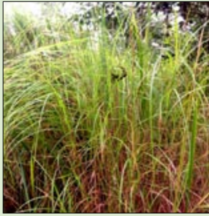
Kangaroo Grass Themeda triandra

I now think this is the time to assist this lovely native grass, probably by as little as a