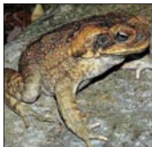
Cane toad, Bufo marinus

It is broadly thought that anything that eats a Cane toad, dies. Yet Wikipedia offers that in its native habitat, the Cane toad is prey for many species. Outside its native range there are also many species, including the Australian native Tawny