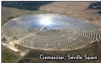
Gemasolar, Seville Spain

Beyond Zero Emissions (BZE), an independent, not-for-profit research group – including engineers, scientists, economists and many other diverse workers presents their roadmap for taking Australia to 100% renewable energy within 10 years. Their fully-costed plan, published in partnership with the University of Melbourne