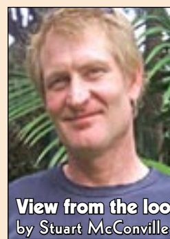
View from the loo by Stuart McConville

Breeding them is relatively simple, with adult flies laying thousands of eggs that hatch in 4 days. Composting toilets can be retro-fitted to enable soldier fly larvae to breed within. As the adults have no mouth parts, they cannot spread human byproducts. They live simply to breed, lay eggs and die. I