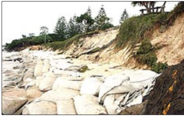
Belongil beach erosion - photo courtesy ABC

Ms Faehrmann says the construction of a rock wall would result in the loss of the beach as the on-going