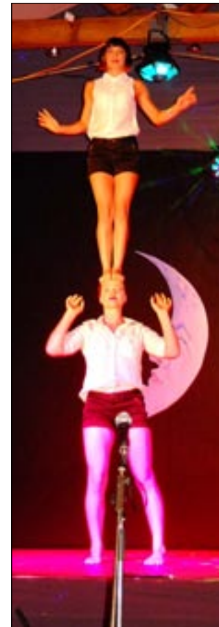
Brisbane acrobats Twisted Hitch

The Cabarets have proven to be very popular shows and bookings are essential. Ticket and table reservations are still available at Perceptio at Nimbin Hall (ph 6689-1766). The evening is catered by Hearth and Soul, and the show is licensed (no BYO).