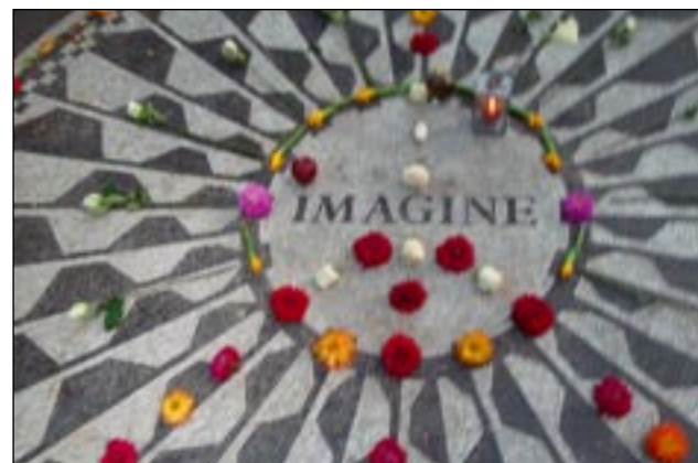
community will participate in making it.