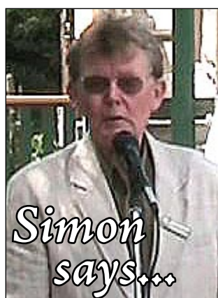
by Simon Clough, Deputy Mayor, Lismore City Council

Council workload seems ever-expanding at the moment – no sooner have we scrambled over one hurdle than another one looms.