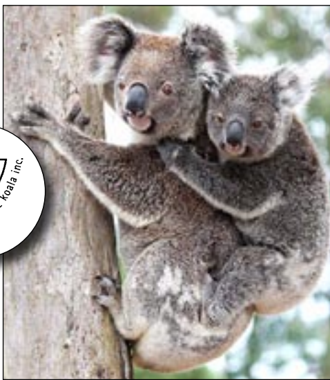
Kal and Mum

As many readers will be aware, there is no legal requirement to consider the impact of vegetation removal on koalas or other threatened species where there is exemption to the Native Vegetation Act. Clearing planted windbreaks falls into this category although work must stop if a koala is seen in a tree and resumed only after the koala has moved on. Even so koalas are injured and occasionally killed.