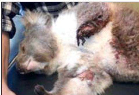
One of the koalas injured by harvesting operations

To report a koala in trouble, or a sighting (live or dead), please ring Friends of the Koala's 24/7 Rescue Hotline: (02) 6622-1233. For information about koalas, their food trees, how you can assist koala conservation visit: www.friendsofthekoala.org or email: info@friendsofthekoala.org or phone 6621-4664. We can also be followed on Facebook. To report environmental incidents, including removal of koala habitat ring the 24/7 Office of Environment & Heritage Enviro Line: 13-15-55.