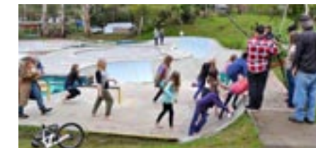
Filming 'The Four Skateboarders of the Apocalypse'

workshops, pop into the Nimbin Youth Club or contact Darmin on 0428 337 088.