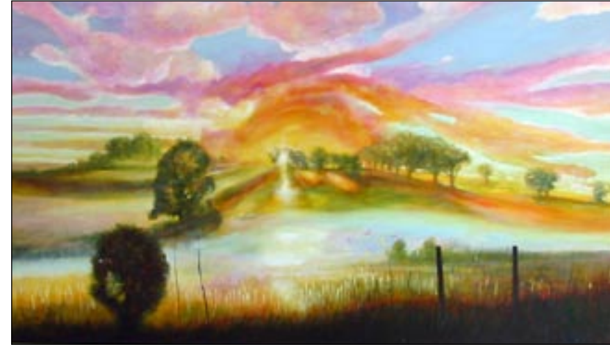
'Aurora Over' by Gareth Deakin

The exhibition runs until 29th September.