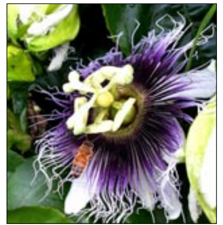
Bee working on Passionfruit flower, Tutti Fruitti Farm, Lillian Rock