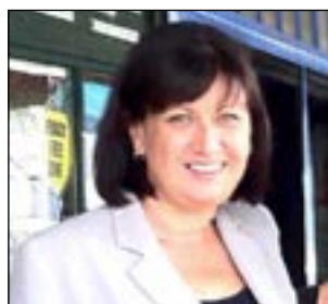
by Justine Elliot

Local pensioners will have received a boost to their payments in March with an increase in the pension that includes the start of the new Clean Energy Supplement. From March