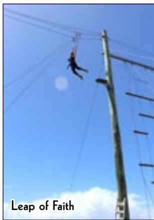
Leap of Faith