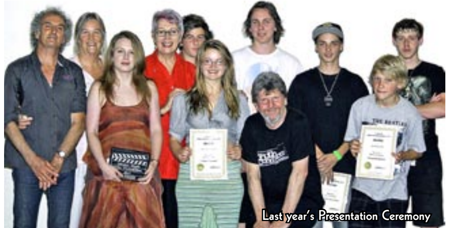
Last year's Presentation Ceremony

Entries close at 5pm on Monday 10 th December with the winners announced and prizes awarded on Saturday 15 th