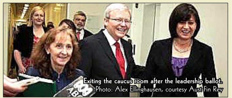
Exiting the caucus room after the leadership ballot.

Member for Page 63 Molesworth Street Lismore Phone 1300-301-735