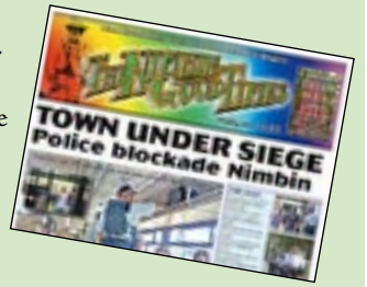
NGT front page, March 2011