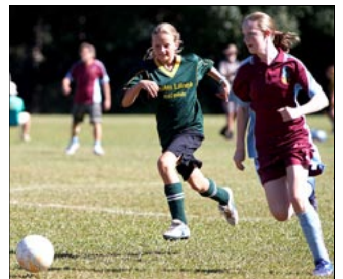
11s Headers player pressing her Casino opponent.