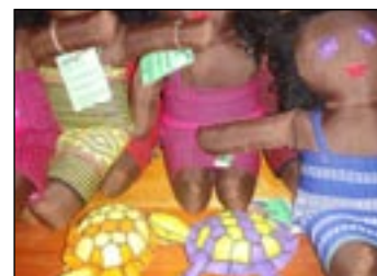
Beautiful handcrafted dolls and bags.