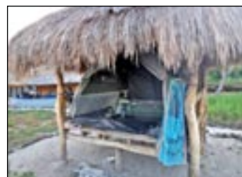
My gazebo at $30 US per night.

On my final day on the island I was lucky enough to be invited to join the water-taxi team to go snorkeling when they went diving on the western side of the island. This was such a bonus as the sand on this side is white and the water is so clear you can see the coral 15m down from the boat. Our return to Dili was blessed with another dramatic rainbow display that was the perfect backdrop for about three dozen pilot and melon-headed whales frolicking in the water! Another great adventure!