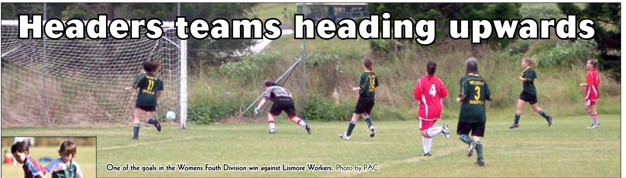
One of the goals in the Womens Fourth Division win against Lismore Workers.