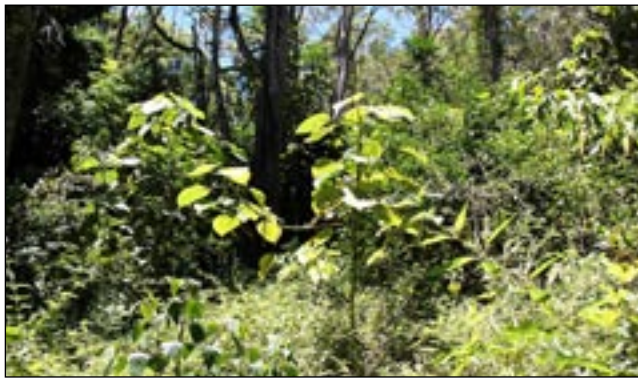
Pioneer species, Stinging Trees, stepping up to fill the gap left by a tree blown down in a storm

Lantana is one of the WONS – Weeds of National Significance. It is widely distributed across the country, is toxic to stock and vigorously establishes where bushland has been cleared and the canopy interrupted. In this region of high rainfall lantana can climb fifteen metres up a tree. Its sprawling,