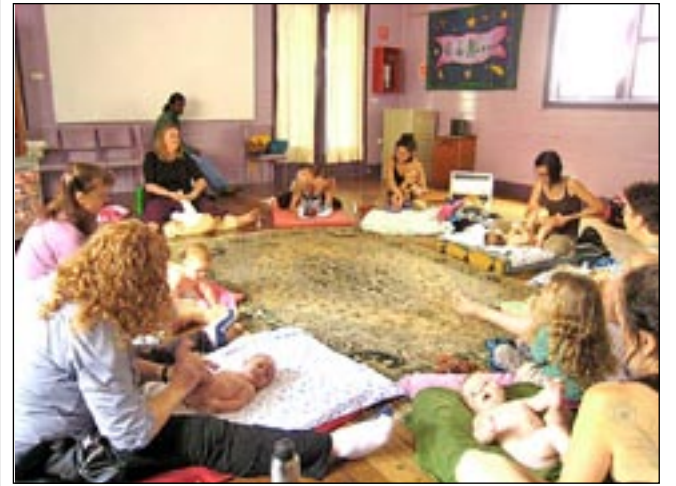
Mums learn some new tricks for massaging their infants