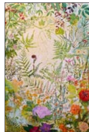
Garden Tapestry A Window through the Seasons by Monique McCarthy