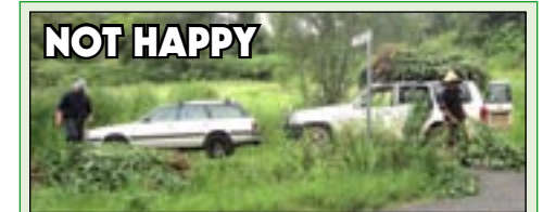
Police involved in the removal of cannabis plants from a Blue Knob property on 19th January had to cope without their pan-tech, arranging carriage of the immature plants on the roof racks of otherwise unmarked 4WDs. Attempts to incinerate the damp haul in a local quarry also proved unsuccessful.

MOB (MardiGrass Organising Body) meetings are on the back verandah of the HEMP Embassy every Friday from 5 pm, and everyone is welcome. If you have an event or something you want to see happen, let us know sooner rather than later.