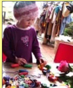
Toph at preschool

In Term One a similar event was held. It was a gorgeous night with a very