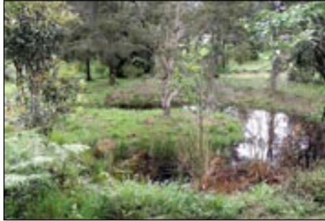
Seasonal creek at the proposed park site.