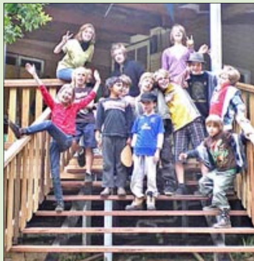
Some students testing the new entrance to the school.

On Sunday a bushwalk will be held through the community, with a picnic lunch at the North End waterhole.