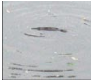
Platypus with offspring in Mulgum Creek

Its location means that visitors can easily purchase refreshments from the locals such as the Bush Theatre and perhaps book in at any of the backpackers nearby and stay overnight to catch the early morning play of the platypus. This space creates the