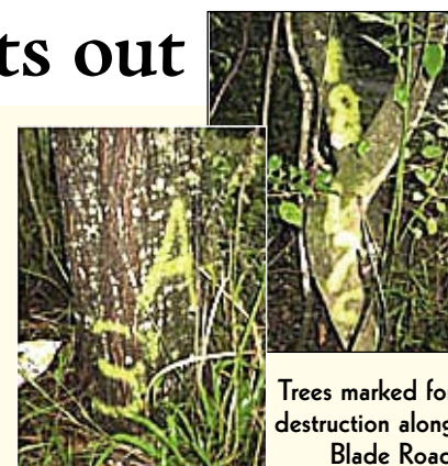
Trees marked for destruction along Blade Road