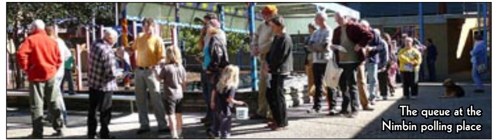
The queue at the Nimbin polling place

The results varied of course across the polling places, with ALP on 48.26%, Nats, 33.2% and Greens 15.85% at Lismore Central. At Grafton, ALP received a massive 56.26%, Nats 35.9% and Greens only 5.36%.