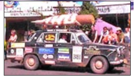
"The Hippies" car (above), a 1970 Ford Fairlane, won the 26th Annual B-shed to Byron Bash, which raises money for Variety Club children's charities.

as well. Like I said, Nimbin was smiling and laughing and everyone had a BBlast.