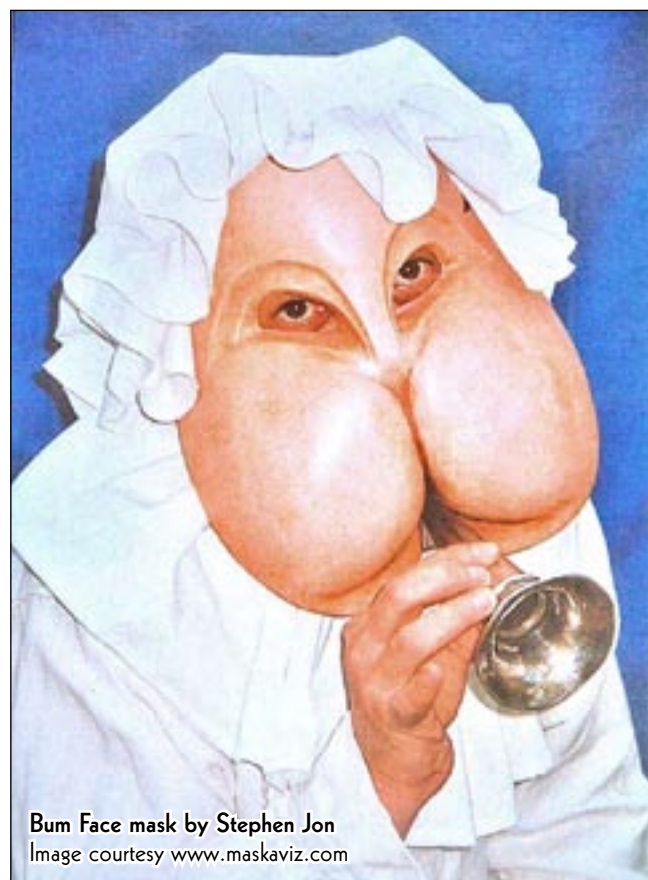
Bum Face mask by Stephen Jon

has become acceptable in America now too, almost replacing boobs, jugs and hooters. It's the sanitized expression of a society with butts for bums, dicks for brains, shoot for shit, band-aids on its nipples and pubes, and sex that happens on a