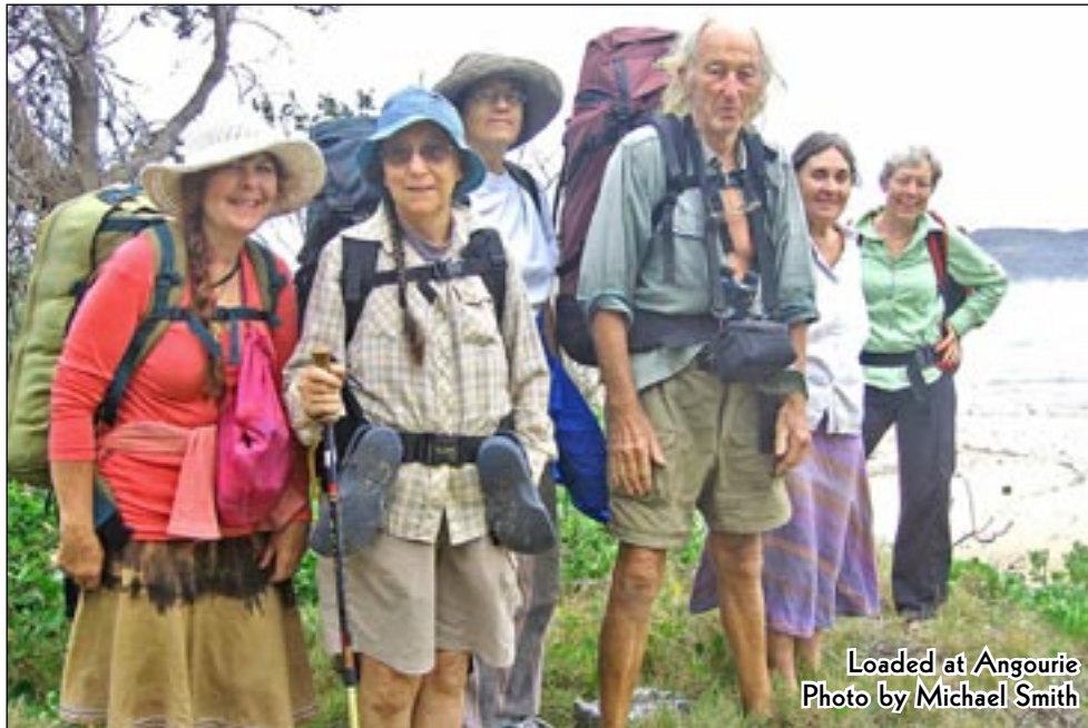
Loaded at Angourie

Wanganui Gorge, bold, neglected and beautiful. Do it as often as you can.