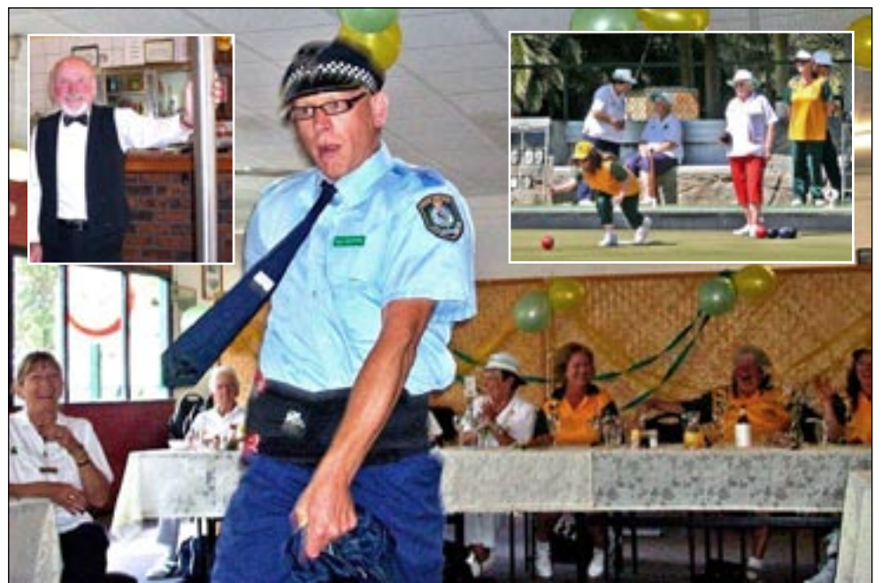
Women bowlers from far and wide enjoyed an entertaining day at the Nimbin Bowling Club including this 'officer' who proceeded to perform a strip search on himself.