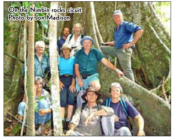
On the Nimbin rocks circuit

Bitou, introduced by sandminers to help "rehabilitate" the dunes they had destroyed, is a nightmare weed, infinitely worse than lantana, that has smothered and destroyed tens of thousands of hectares of coastal native vegetation over much of the eastern seaboard of NSW – don't